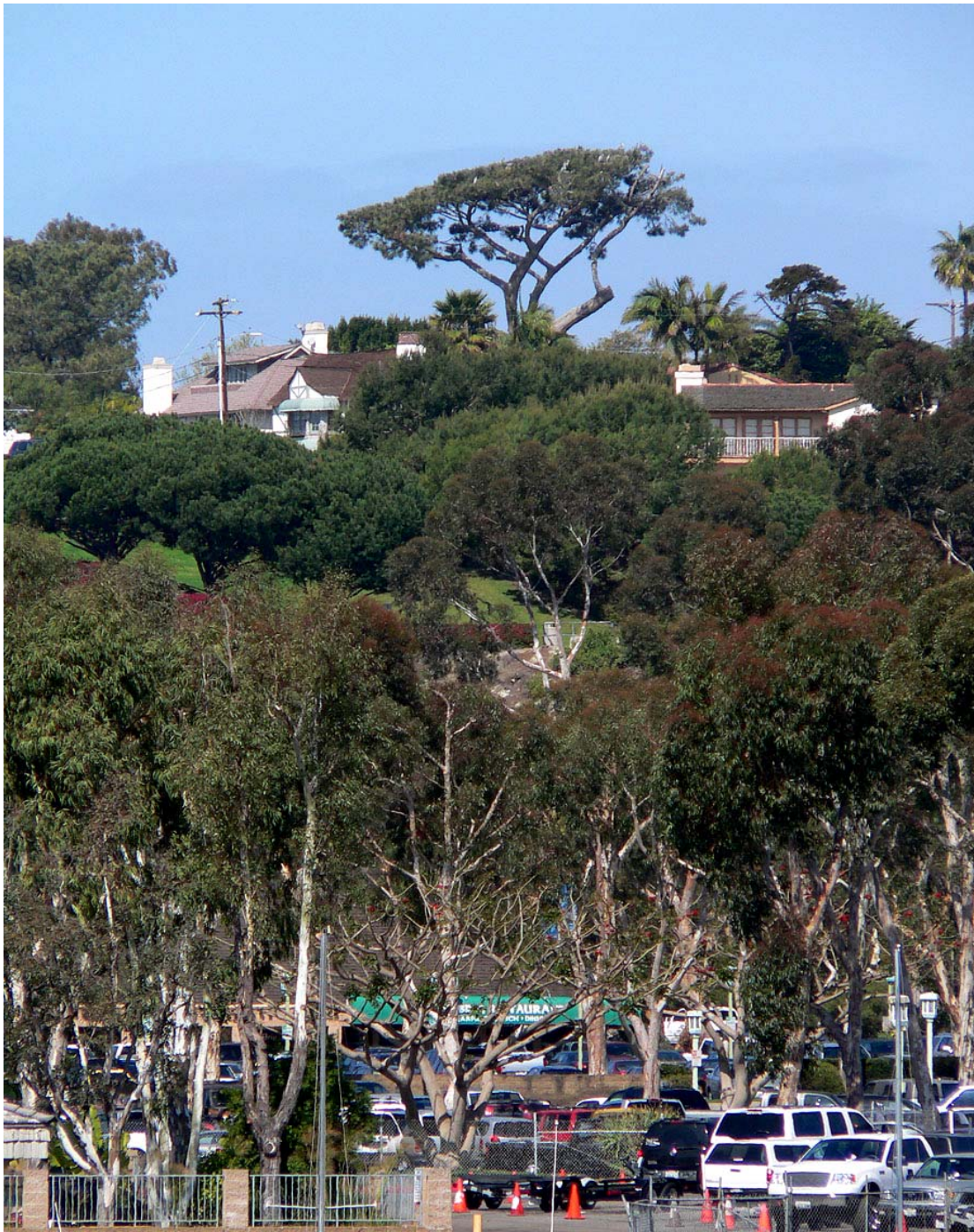
Figure 2. View from the end of Puerto Place, facing northwest. Several Great Blue Herons appeared to be nesting in the top of the tall, flat-topped pine in the background of this image.