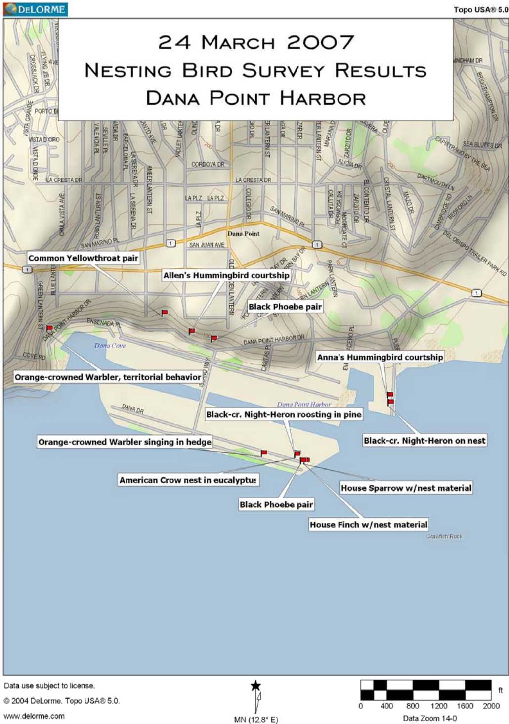
Figure 1. Evidence of definite or potential bird nesting (and heron roosting) detected during the March 24 survey (each point was mapped with a GPS unit accurate to approximately 12 feet)